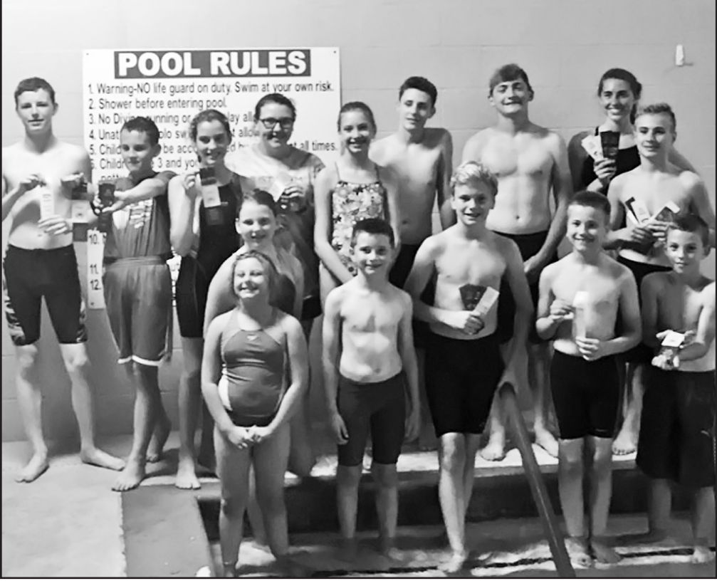
The members of the North Georgia Rapids swim team, who recently competed in Clarkesville at the Splash Swim Meet 2018.